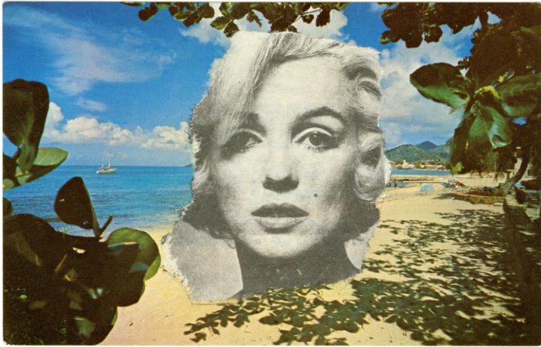
Marilyn Monroe/Shadows (1974) by Ellsworth Kelly.

It usually has a picture or some words on it and is sent from a place you are visiting.