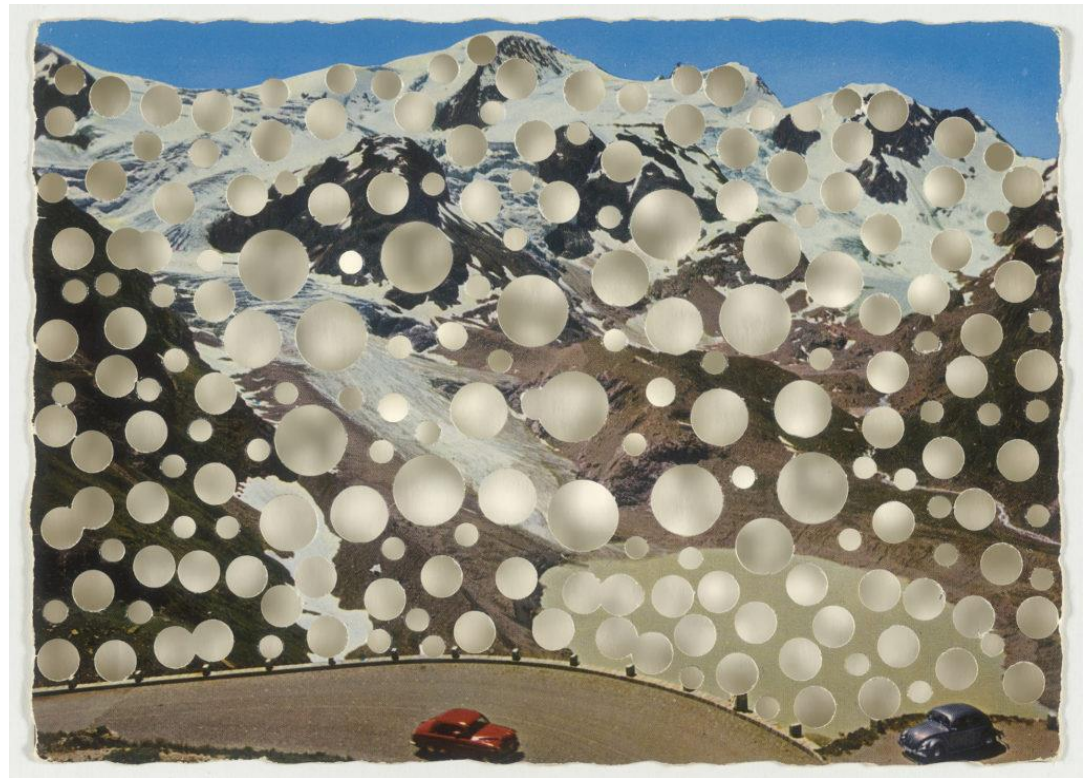
Rachel Whiteread, Untitled , 2005.