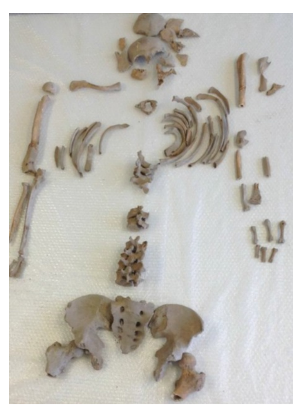
The bones of the male; Note the prominent brow bone

bones were indeed the remains of two individuals, one male and one female. The male, who died aged between 43-55 years of age, was particularly tall. Using the length of his right ulna as a guide, it is estimated that he stood at somewhere between 176.86cm and 186.3cm (just over 6 feet). One notable feature was that he had suffered a broken arm as an adult but the wound had healed leaving scar tissue. The definition on his brow bone was also very distinctive, leaving no doubt as to his sex. The female, by contrast, was very slight in build, and Kerry-Ann remarked on the small size of her pelvis as well as some possible parturition scars, indicating the possibility of childbirth. The polishing of bone due to the absence of synovial joint fluid indicates that she may well have suffered from Degenerative Joint Disease (DJD). The teeth were in good condition, which taken with the fact that they were in stone coffins, indicates that the individuals were high status individuals. Further ground was broken by the rather surprising results of the carbon-dating that reveal that they died 992 years ago (+/- 28 years) and therefore date from anywhere between 994 and 1050 AD - two hundred years earlier than previously thought.